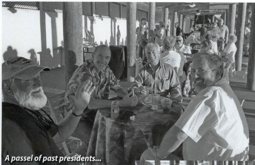
A passel of past presidents...