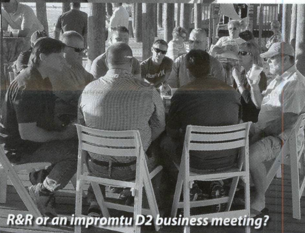
R&R or an impromptu D2 business meeting?