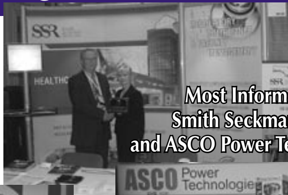
Most Informative Smith Seckman Reid and ASCO Power Technologies