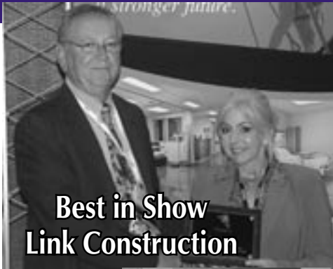
Best in Show Link Construction